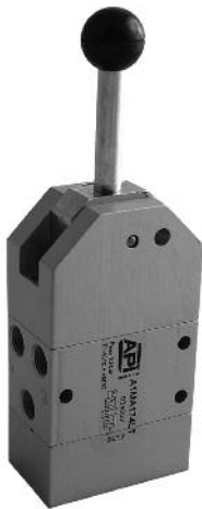
Series of spool valves, with static seals, high flow.